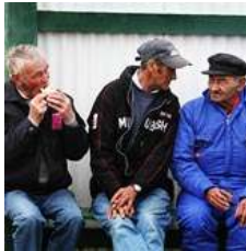
as fresh diplomatic dispute emerges

Order By: Newest first | Oldest first | Most recommended