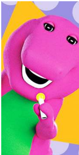
A song by Barney the Purple Dinosaur was allegedly used by torturers

A coalition of musicians including Pearl Jam and R. E. M. backed a formal demand yesterday to be told if their songs had been used to torture detainees in Guantánamo Bay and Iraq.