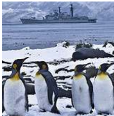
Full coverage of the unfolding dispute over the Falklands

How a gift horse revived Falklands race Windy, raining and so British Tension rising in the Atlantic Leader: troubled waters Revitalised since 1982 Oil? maybe. But hard to use